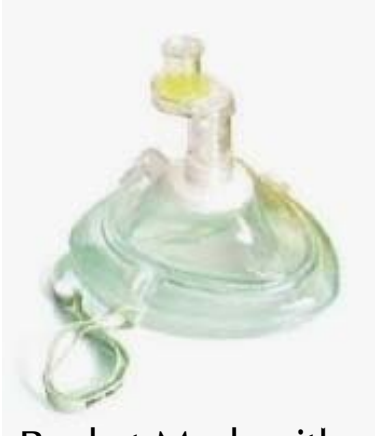
Pocket Mask with One-Way Valve