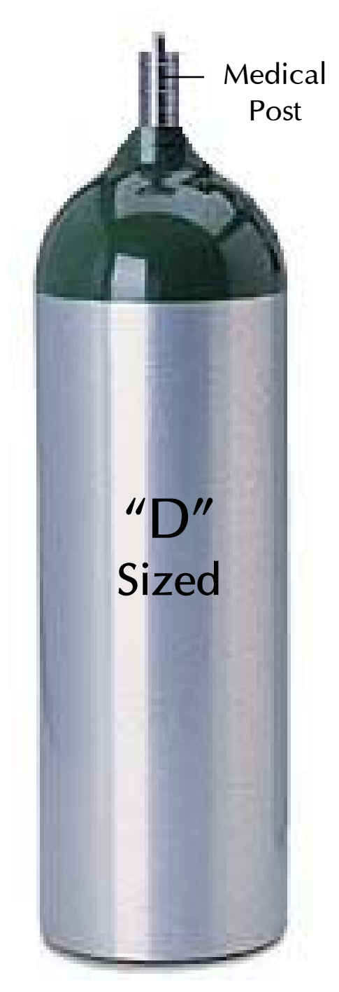
White, Silver, or Green 2200psi when full