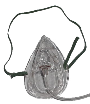
Simple Face Mask